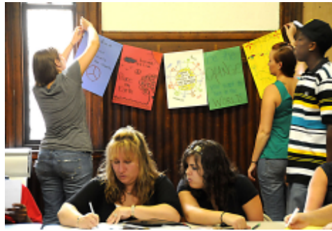
YOUth VOICE participants create Peace Flags in which hopes and dreams of peace are created on flags to be hung in various locations in the City.