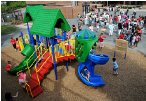
Doran Elementary School children enjoy using the new playground equipment donated by Children In Balance following the opening ceremony.