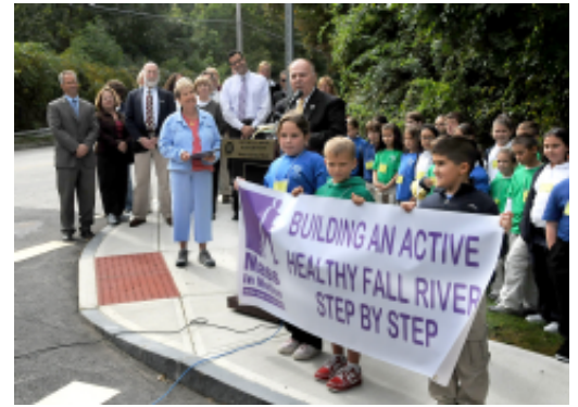
Officials gather at the southern end of Meridian Street to announce the award of a Mass In Motion grant to the City to promote physical activity.

Mass In Motion ( www.mass.gov/massinmotion ) is working to encourage more Massachusetts residents to lead healthier lifestyles.