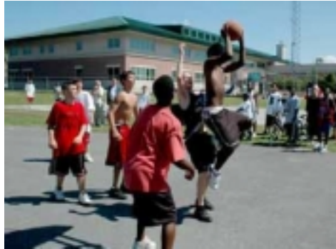
The 3rd Annual Hip Hop Hoop Fest took place at Britland Park, behind the Fall River Police station.

O ver 120 youth and 18 teams participated in the 3 rd Annual Hip Hop Hoop Fest at Britland Park on September 2 nd , the culmination of the summer-long Community Outreach Program.