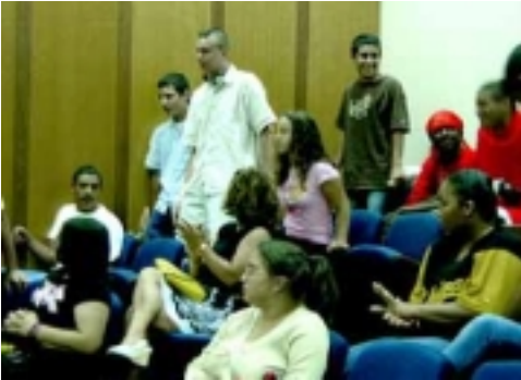
Participants in the summer YouthWorks program who had a perfect attendance record are recognized.

Y outhWorks, a summer employment program funded by the Commonwealth and run by the City, employed 44 youth in various city departments, including the Parks Department, Water Department, Public Works Department, Sewer Department, Traffic Department, and the School Department throughout the summer of 2005.