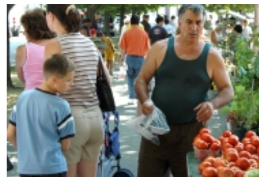
Shoppers can choose from a large selection of produce from local growers at the Kennedy Park market.

Much of the produce is grown on farms in nearby towns such as Swansea and Westport. Some vendors accept food stamps. A similar market also runs on Wednesday mornings at Ruggles Park.