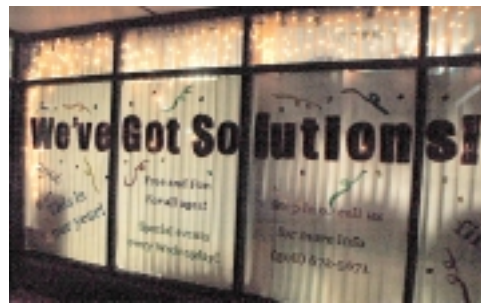
The windows of the Diabetes Association headquarters on Pleasant Street announce new programs for 2006.

Got Resolutions? We've Got Solutions! On Wednesdays during the month of January, the Diabetes Association of Fall River and New Bedford is offering samples of their exercise and nutrition programs. Each Wednesday offers a healthy nutrition demonstration and exercise activity and healthy meals and snack recipes demonstrated by chefs from Johnson & Wales University Culinary Nutrition Program.