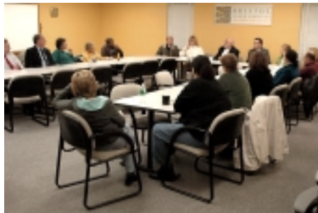
Residents and business owners in the newly-forming Lower Highlands Historic Downtown Neighborhood Association, including the North Main Street business area, began meeting in November, 2005, at Bristol Elder Services to talk about common concerns. Issues included crime and vandalism, road construction and access to city services

As of December 2005 the City of Fall River now has a new neighborhood association, the Lower Highland/ Historic Downtown Neighborhood Association, which meets monthly with alternating times every month to accommodate the business community as well as the residents in that area. Daytime meetings are at 8 a.m. and evening meetings are at 6:30 p.m. at various locations in the neighborhood.